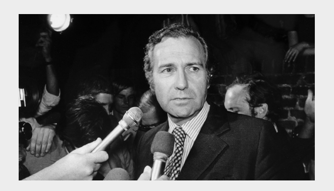
The Real Stonehouse Thursday, 9pm 5th January ITV1

In this companion documentary to the drama Stonehouse, we hear from relatives, colleagues and the police members called in to investigate the inimitable MP.