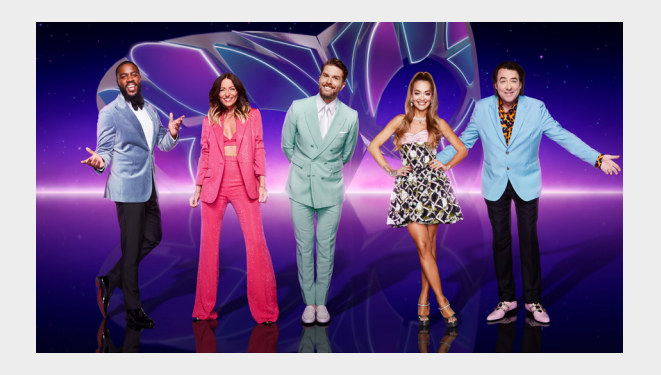
The Masked Singer New Year's Day, 6.30pm 1st January ITV1

TV's craziest guessing game begins its new series. Joel Dommett presents as a new gang of celebrities don costumes and sing with their identities hidden.