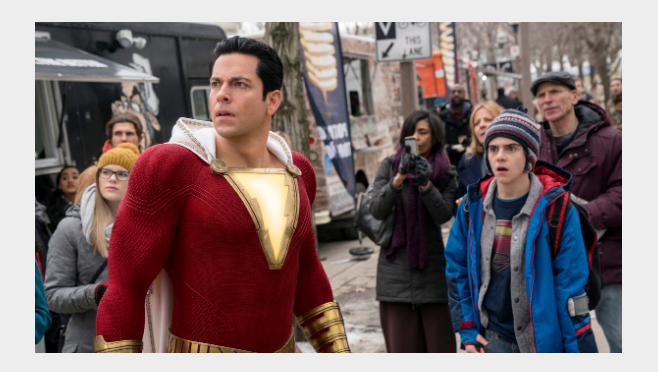
Shazam! Monday, 6.20pm 2nd January ITV2

An action-adventure comedy film - and the seventh instalment of the DC Extended Universe - about a boy in care who uncovers unexpected superpowers.