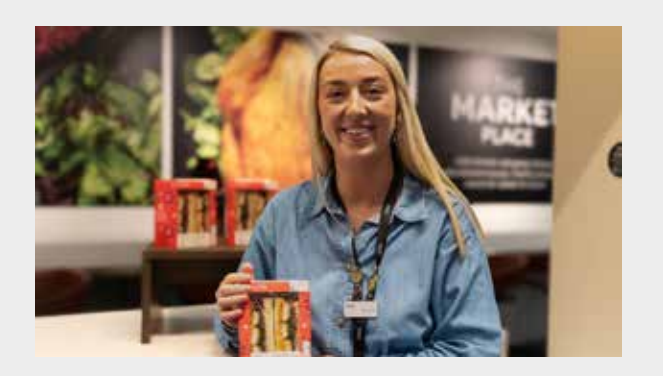
Inside M&S at Christmas Wednesday, 9pm 18th December ITV1

Go behind the scenes of M&S Food's latest and biggest store refresh, taking a peek behind the curtains at the retailer as they approach the hectic festive period.