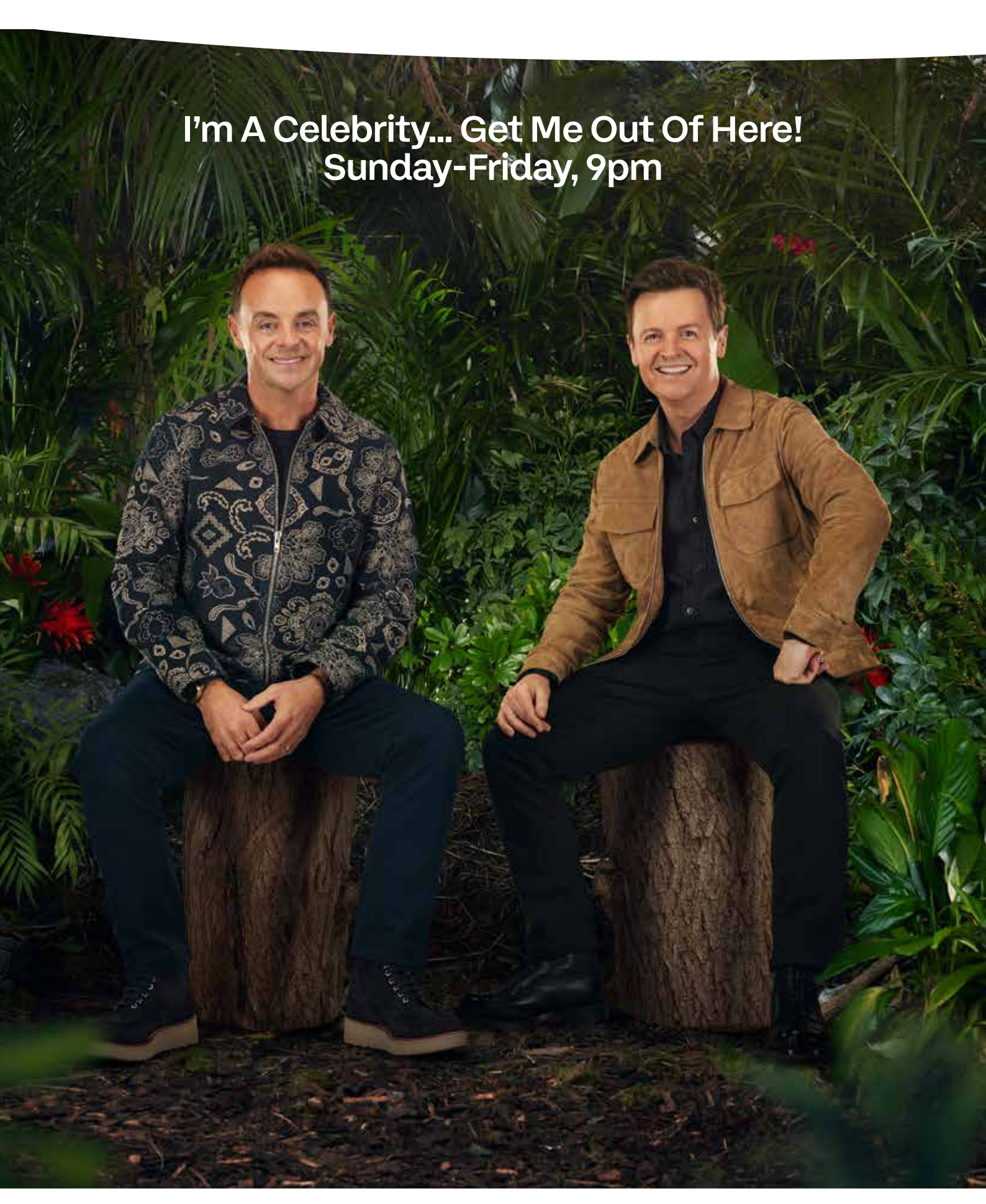
This information is embargoed from reproduction in the public domain until Tue 12th November 2024.

Week 46/47 - Saturday 16th - Friday 22nd November 2024