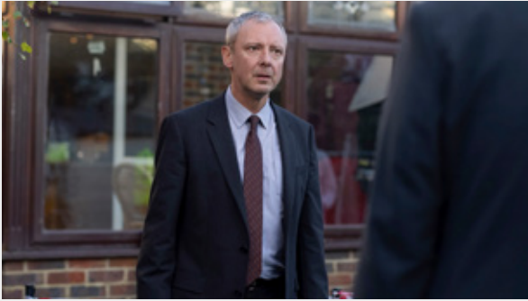
Grace Monday, 8pm 11th November ITV3

An intense crime drama series about Brighton-based Detective Superintendent Roy Grace, a hard-working police officer who gives his life to his job and cracking cases.