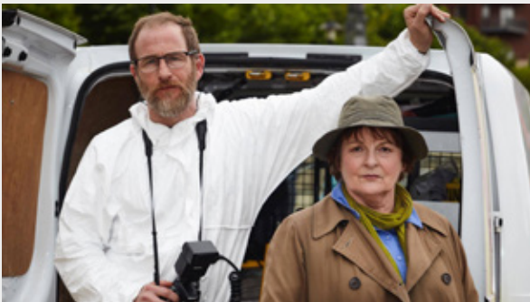
Vera Thursday, 8pm 14th November ITV3

A sinister inquiry into skeletal remains found in a forgotten Brighton storm drain takes Grace down a labyrinthine trail through the past, but it's not only on the professional front that he's soon chasing ghosts on... can Grace resolve the case and his demons?