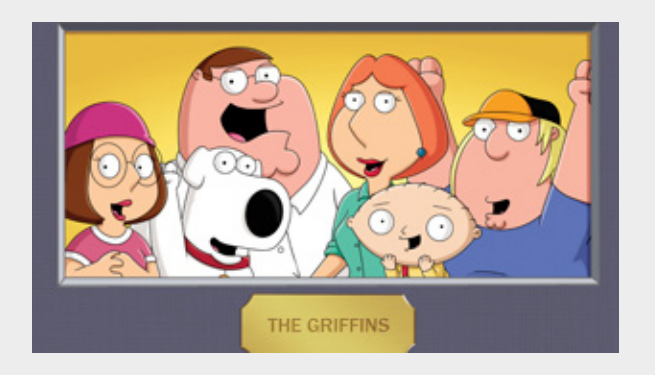
Family Guy Monday, 9pm 23rd September ITV2

The popular long-running American animated sitcom about a dysfunctional family in a wacky Rhode Island town who manage to go from one crazy scenario to another.