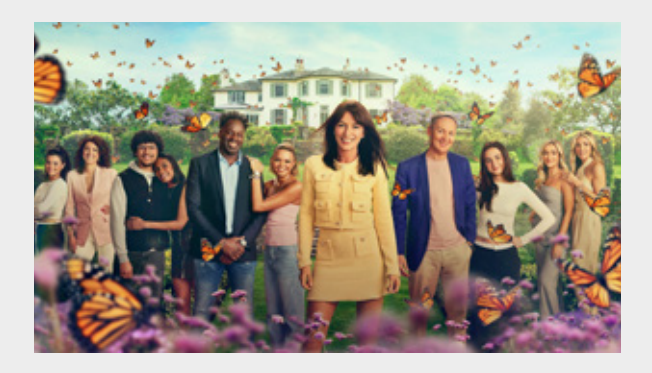
My Mum, Your Dad Monday-Friday, 9pm 23rd-27th September ITV1

This warm-hearted show follows eight single parents nominated by their grown-up kids to spend two weeks in a stunning retreat while giving love a second chance.