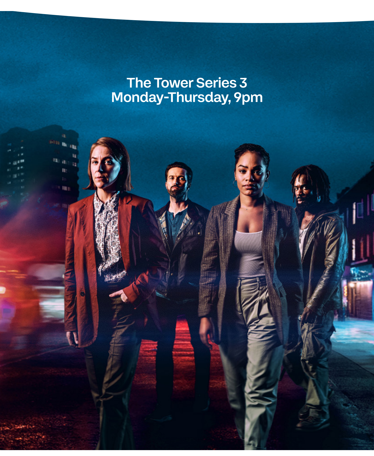
This information is embargoed from reproduction in the public domain until Tue 28th August 2024.

Week 35/36 - Saturday 31st August - Friday 6th September 2024