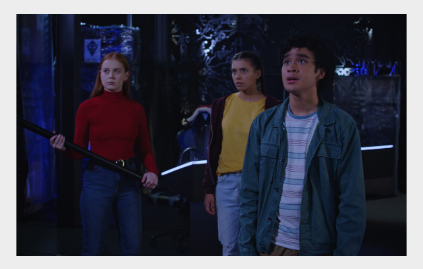
The Gamers 2037 Full series drop on ITVX Kids on Thursday 31st August ITVX