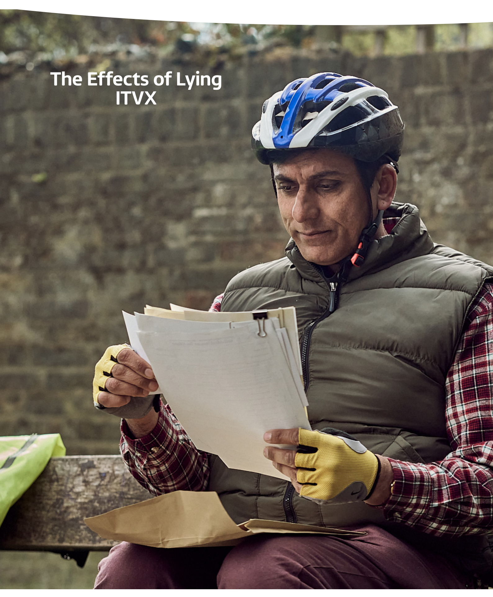
This information is embargoed from reproduction in the public domain until Tue 27th June 2023.

Week 26/27 - Saturday 1st - Friday 7th July 2023