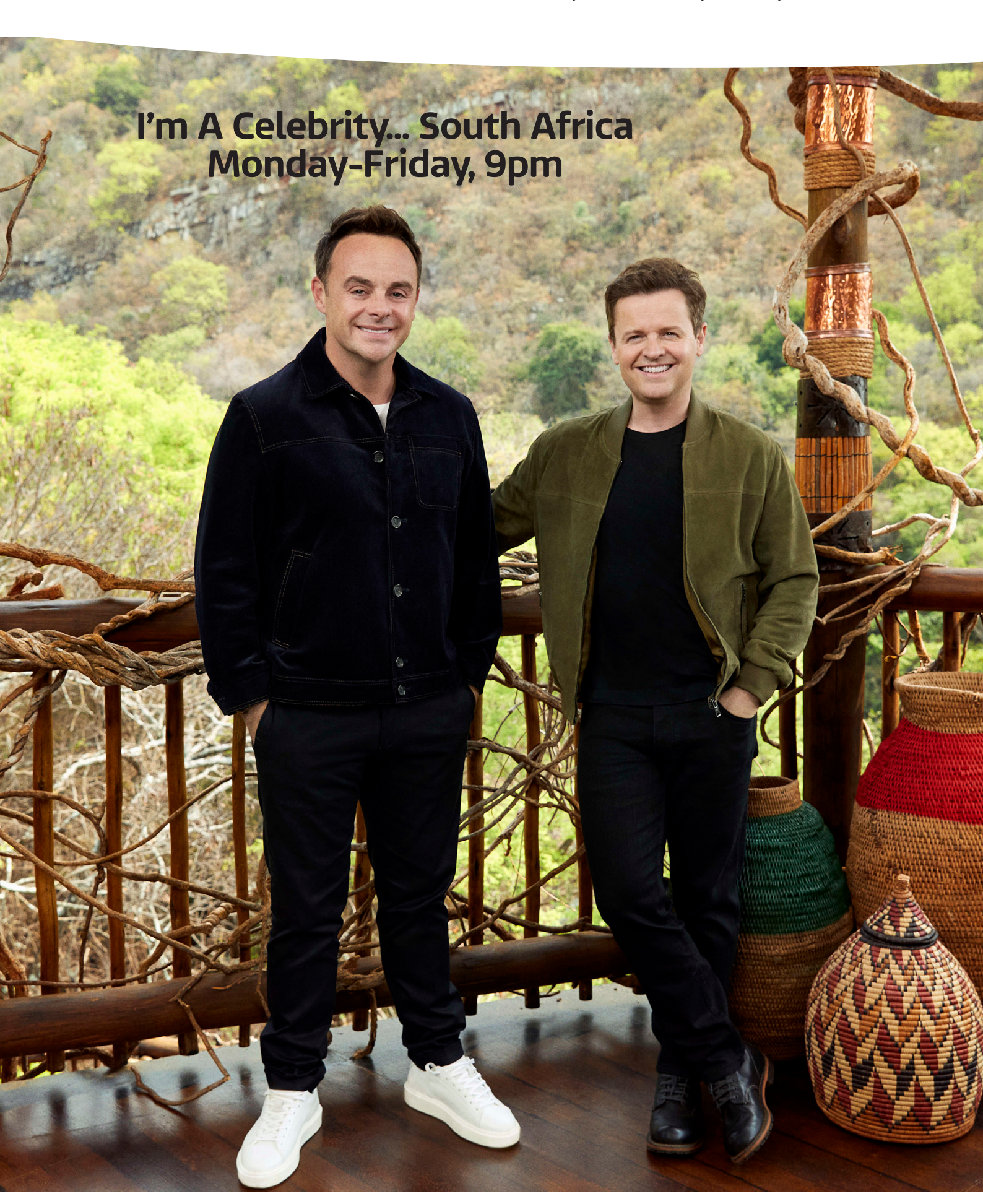
This information is embargoed from reproduction in the public domain until Tue 18th April 2023.

Week 16/17 - Saturday 22nd - Friday 28th April 2023