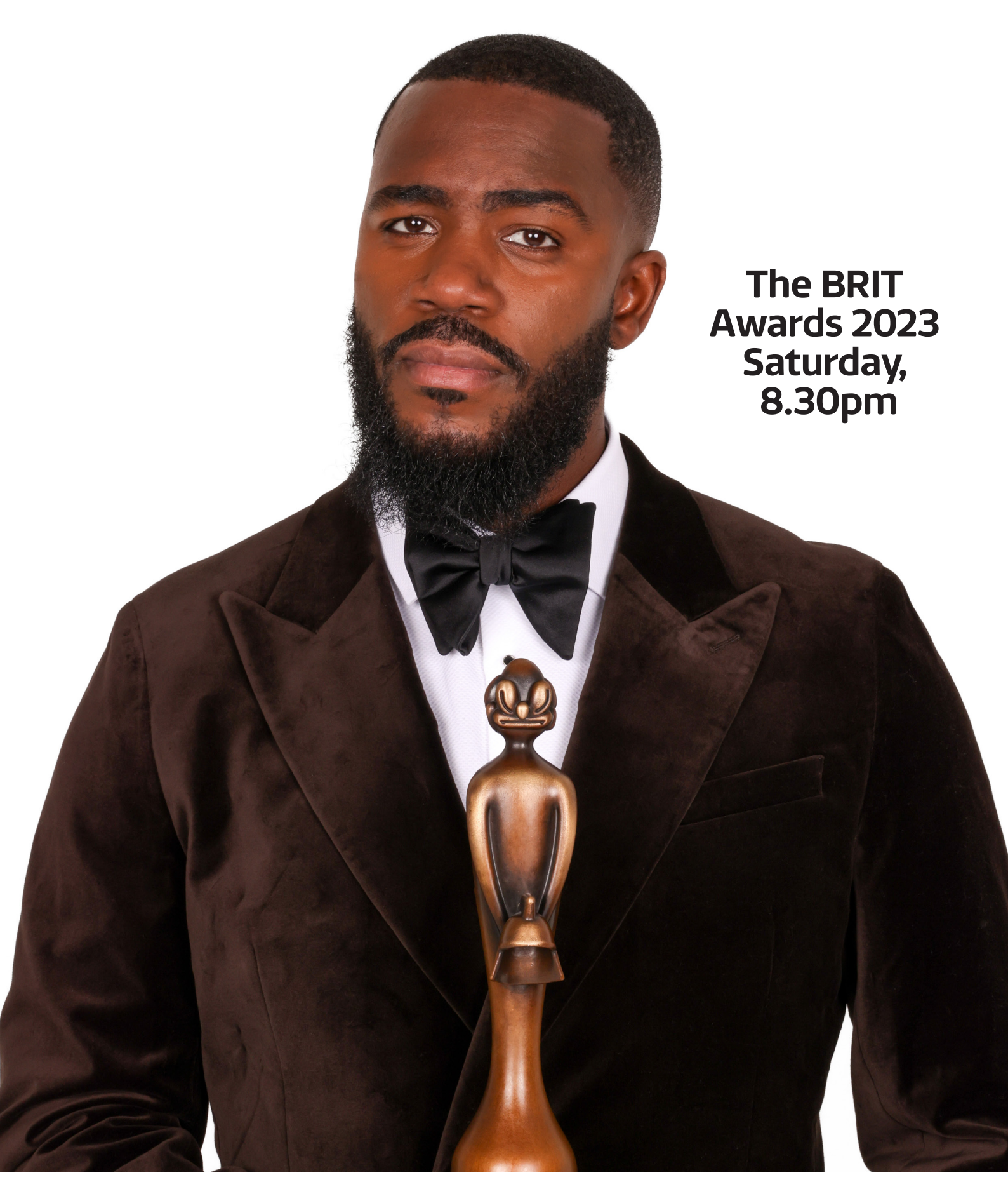
This information is embargoed from reproduction in the public domain until Tue 7th February 2023.

Week 06/07 - Saturday 11th - Friday 17th February 2023